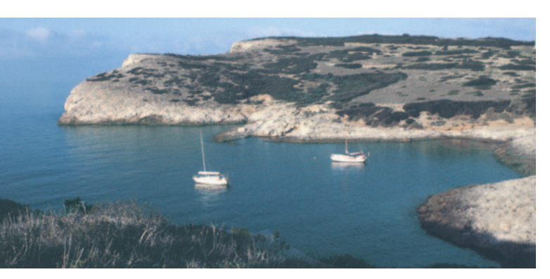
Cala dei Turchi, Isole Tremiti