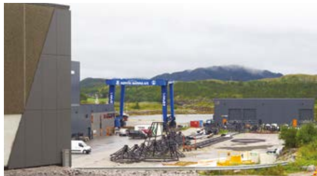
Rørvik Marina AS yard, Marøya. Maintenance and winter storage under cover or outside