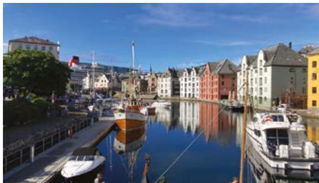
Ålesund harbour looking SW towards bridge at far end of Brosund John Sodd

☎+47 95883400 vakta-hav@alesund.havn.no alesund.havn.no