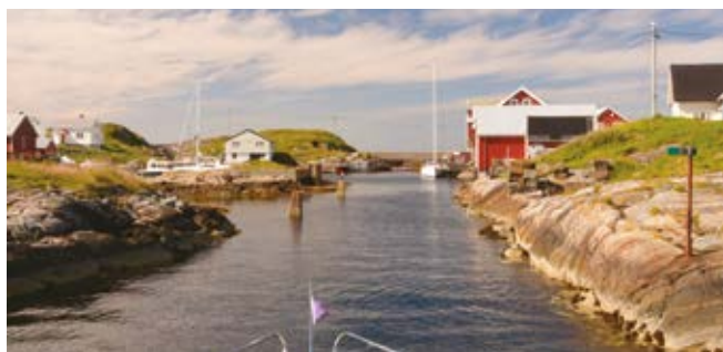
Bjørnsund. Narrow entry. Yacht alongside on guest quay

Not advised, although in settled weather this might be possible N of Nordre Bjørnsund in the bay between Måøya to its NW and the causeways lining it to Maøya (11m; open to NE).