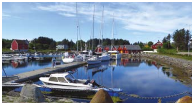
Finnøya, Harøyfjord guest pontoon

Mole harbour on NE corner of Finnøya at the top of Harøyfjord, connected by causeway to larger Harøya to its SW. Entered from N. Long guest pontoon and small boat marina in sheltered SW end; water, electricity; honesty box. Although this is charted as drying, 4m minimum has been experienced on the guest pontoon. Hostel. Clubhouse. Hotel. Marine engine museum (there was formerly a fishing boat engine factory on Finnøy).