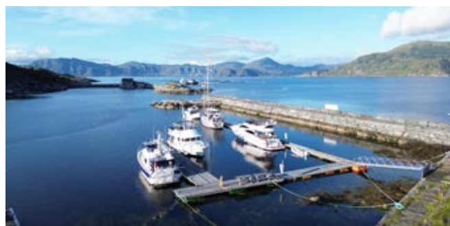
Silda N harbour guest pontoons, looking NE towards Stattlandet John Sadd

Correction The Måløy/Florø hurtigbåt does not call at Silda. Daily ferry four times daily from/to Måløy N harbour hurtigbåtterminal, 20minutes. The S harbour restaurant was not open during the summers of 2022 or 2023.