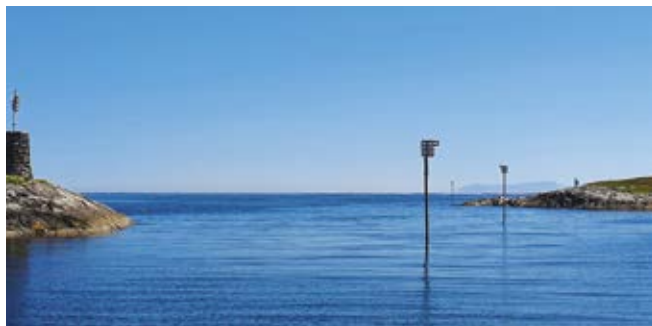
Stoplane, approaching NE exit John Lancaster-Smith

Proceeding from Bud to the Stoplane passage, a shorter route, weather permitting, heads NNW through Storsund (not named on plan) between inshore and offshore groups of islands, E of the light on the largest island (Nordre Odden; not named on plan). Then turn ENE parallel to the shore to pass N of Dubla light (62°55'·15N 6°55'·21E) and between markers offshore of skinny Ersholmen (not named on plan) before turning NNE between islands charted Grønahl and those off the W end of Dråga, continuing past the Stabbeflua light to join the Stoplane passage.