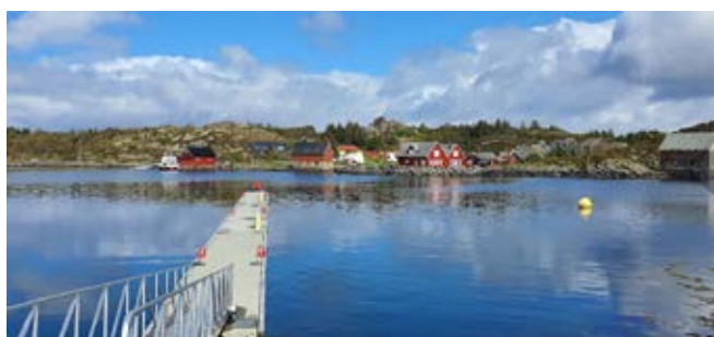
Pontoon at Hamnevågen, Sandøy Hans-Petter Sandseth

New concrete pontoon; c.120m long, to W on port side after mole. Electricity and water.