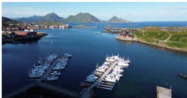
Ballstad: guest berths on pontoon hammerheads in SW corner of harbour John Sadd

Two 25m hammerheads for visitors in SW arm of harbour yacht marina. 2.5–3m, water and electricity, hotel with restaurant.