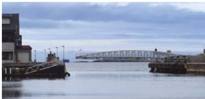
Pedestrian swing bridge, Fosnavåg