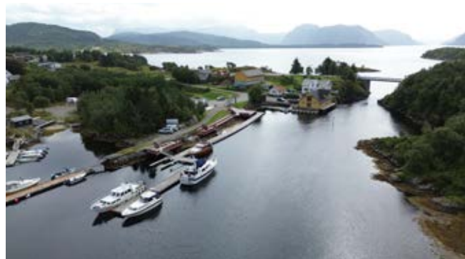
Korssund looking SE to 8m bridge John Sadd

Almost landlocked anchorage in inlet between Klenevågen and Vågane, S of Vilnesfjord, between M (Hellershamn) and Dalsford on plan. Straightforward entry from Vilnesfjord from WNW, minimum depth 3m. Two charted rocks (4.2m and 3.2m) before entering main pool. Anchor in 7.4 m.