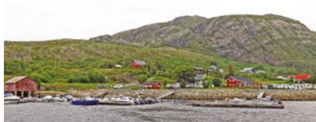
Utvorda hammerhead seen from exposed entrance John Sadd

Not yacht-friendly. Hammerhead nearest harbour entrance is exposed. Unlikely to be space on the three main pontoons. Short (6m) pontoon off quay.