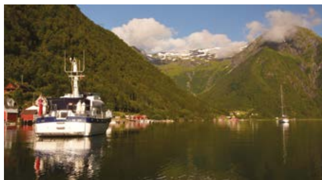
Esefjord, Balestrand small boat harbour and fjord anchorage