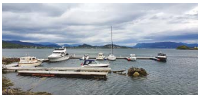
Gåsholm, Ålesund Seilforening Seilerhytte marina Hans-Petter Sandseth