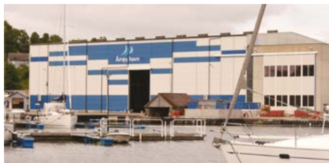
Åmøyhavn, Vestre Åmøy, winter storage halls

* Winter layup. In two heated halls, boats 17–80ft (mainly for boats under 34ft), or outside (water & electricity) ashore. Maintenance and repair. Rigging. Early booking advisable. ☎+47 932 59 300, post@amoyhavn.no , www.amoyhavn.no