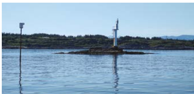
Ersholmen behind Dubla light and marker