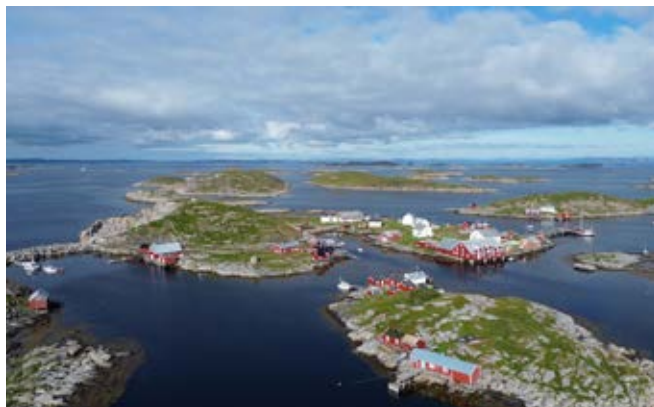
Sørkjæslingen looking NE. Guest pontoon on left, between Nakken (Na) & Lyngnesholm