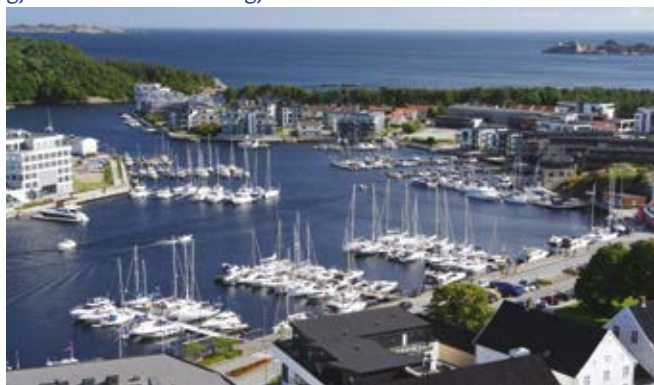
Mandal visitors' pontoons in foreground, looking SE to entrance John Sadd

☎ +47 982 47 262, ☎ +47 400 05 152, mandalhavn@mandal.kommune.no, gjestehavner/mandal-gjestehavn