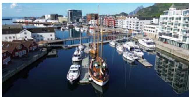
Svolvær: guest berths NE of bridge to Lamholm, looking across bridge to town centre berths John Sadd

More room for visitors with new pontoons NE of bridge to Lamholmen Island. Deeper (3+m) and quieter than outer end of the old longer pontoon near town square. Water and electricity.