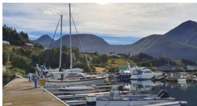
Sætre (Vartdal) Hans-Petter Sandseth

The village is Sætre. The marina is Vartdals Småbåtlag. N/S concrete pontoon. Moor on E and N sides. Toilet in service building. Payment by Vipps.