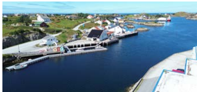
Nikkøy, Bulandet: visitors' pontoon near supermarket and café

Add Ferry to Hardbakke. From Hardbakke, bus to Krakhella, then fast ferry to Bergen (see p.153,).