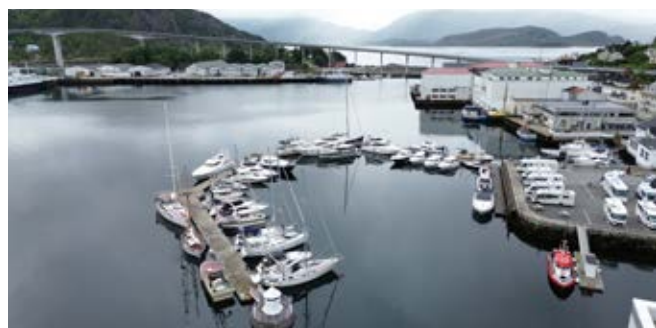
Måløy visitors' marina looking SE towards 40m bridge John Sadd

Add Express boat to Bergen, express bus to Oslo.