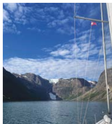
Jøkelfjord at midnight in early July Will Eaton

Good holding off Vika at 70°04'·3N 21°59'·2E; 8-10m. Local moorings and steep shelving make access to the anchorage marked 'J' tricky for more than one yacht. 'Ecopod' style hotel on the beach at Jøkelfjordeidet (position given in the book).