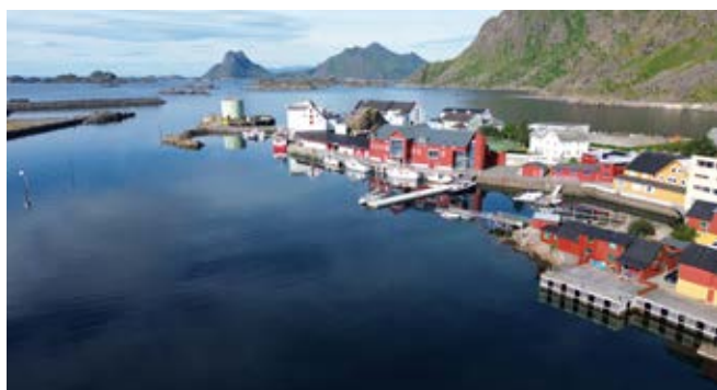
Stamsund: guest berths SW of pub and restaurant John Sadd

Enter N of Stor Buøya. No access between Buohavn and main Stamsund harbour. Pontoon.