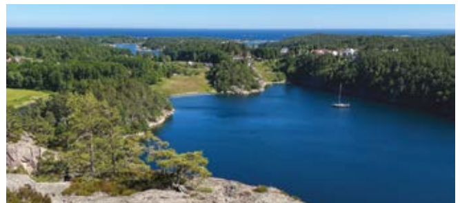
View S over Lusekilen from the top of Videheia to its N Hamish Wilson

Anchorage N of the Blindleia, SSE of Ingridnes. Anchor near head in 10m; mud. Good view from top of Videheia to N