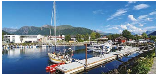
Ørsta guest pontoon, boats to 40ft Hans-Petter Sandseth

At head of 5M Ørstafjord. Stone mole. Pontoons. Depth to 2.2m, greater than it seems on chart (two 1m spots on small boat pontoons). Yachts to 40ft, depth to 2.2m, on NW pontoon. Water, electricity. Launderette. Fuel (diesel, petrol). Small town with shops, restaurants, hotels; Ørsta-Volda airport 3km. Spectacular mountain surroundings.