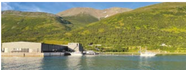
Pontoon halfway up Nord Lenangen Will Eaton

Pontoon with water and electricity on S side of wooden fishing pier on point halfway up fjord. Depth on outer side c.10m. Anchor in 8m.