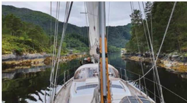
Narrow passage S of Remøya to avoid Aursund 16m bridge John Lancaster-Smith

Add The 16m bridge near the N end of Aursund can be avoided by passing W of the island Røttoy. 28m bridge. The passage S of the island is narrow (27m), depth charted 2-5m.