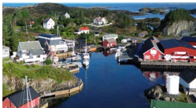
Værøyhamn looking past visitors' pontoon in NW corner of harbour John Sadd

Add Toilets, showers, launderette. No fuel. Ferry to Askvol from ferry terminal near supermarket, c.20mins walk to S.