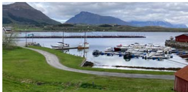
Leirvikbogen looking NW past guest pontoon and fish factory

Showers and launderette in club house. Supermarket. Fast ferries to Bodø and Svolvær.