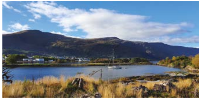
Gåsholm/Flatholm lagoon

Sheltered lagoon S of Flatholm and Gåsholm to N, entered from S between Tennholm and Bukholm (neither named on chart). Anchor, avoiding charted wreck and underwater cable to E between Gåsholm and Sula N coast; 3-14m. Moor alongside Flatøya. Moorng buoy (10 ton).