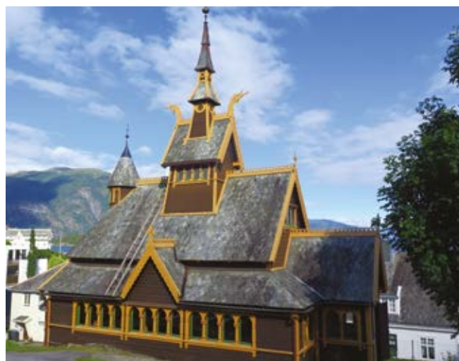
The English church in Balestrand John Sadd

On the corner of Sognefjord's junction with the short (2M) Esefjord; 2M S of its junction with Fjærlandsfjord. Wooden guest quay, N of Kviknes Hotel (hotel guest berths). Visitors' berths in small boat marina. Water, electricity; toilet, shower, washing machine. Unusually for a Norwegian fjord, Esefjord has reasonable anchoring depths (mainly 12-14m, less as it narrows towards its NE end). Museum of Tourism. Sognefjord Aquarium. 'English Church' (St Olaf's), built in 1897 in the style of a stave church, is dedicated to the English wife of Knut Kviknes, owner of the Kviknes Hotel.