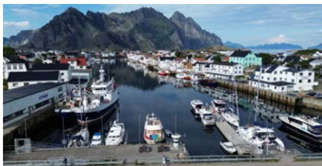
Henningsvær looking NE; main guest berths in foreground

Add position: Anchorage to NE: 60°09'.9E 14°14'E