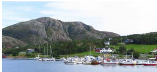
Sandnes hammerhead guest berths Wave-breaker port hand on entry. Fuel berth extreme right John Sadd

Guest pontoon in first marina on SE side of inlet. 25m hammerhead. 8m. Water, electricity. Most other berths occupied by locals. Supermarket. Fuel (petrol, diesel) on Coop pontoon. Exposed to N.