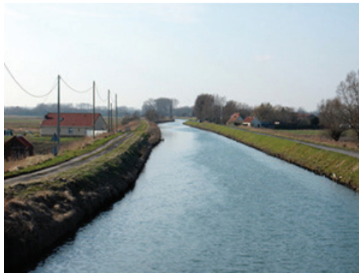
The lift-bridge at Hennuin (top), and canal landscape near Ruminghem.